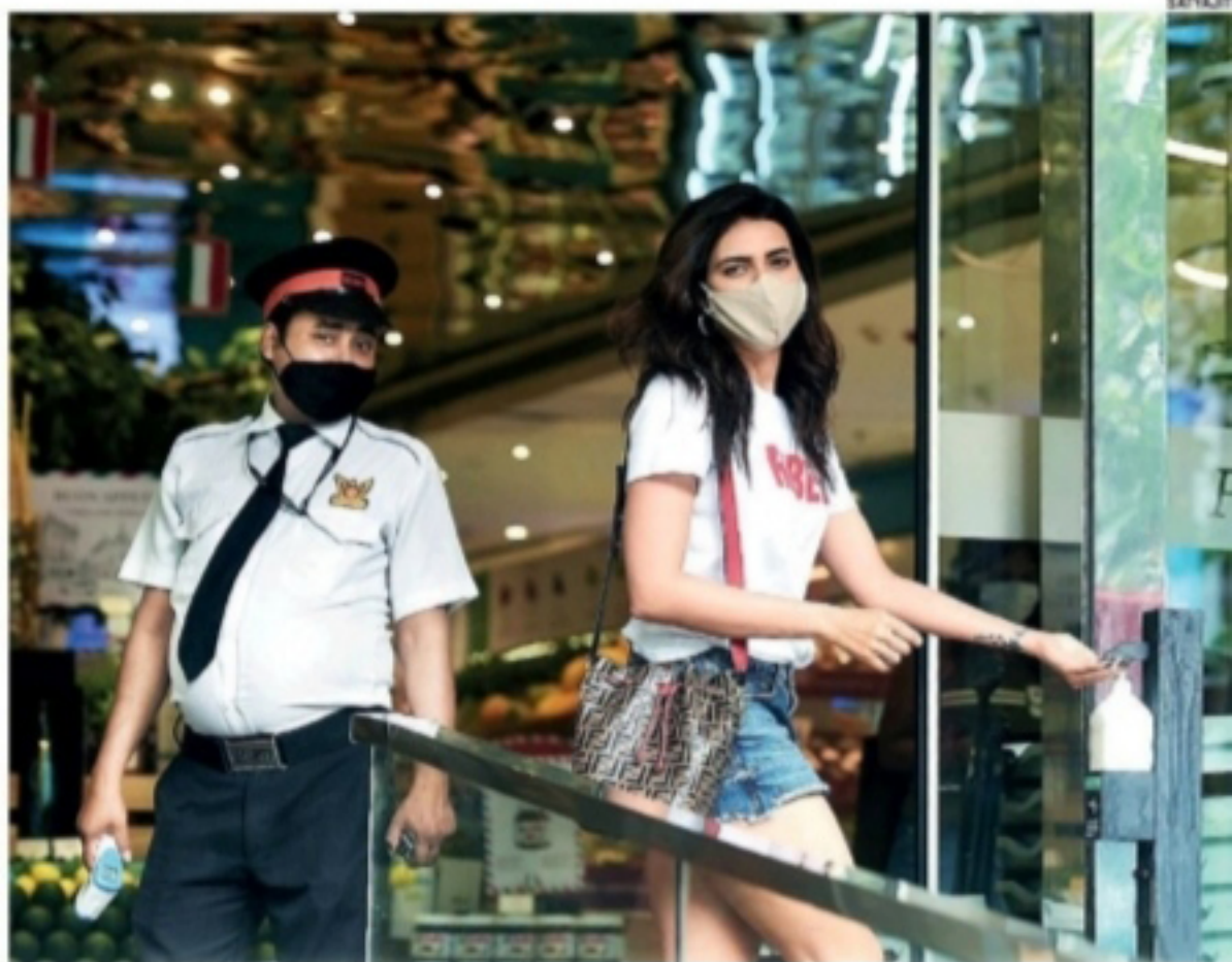
MODEL BEHAVIOUR Actress and model Karishma Tanna at a food hall in Khar on Wednesday